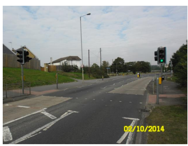
Noak Hill Road South bound approach