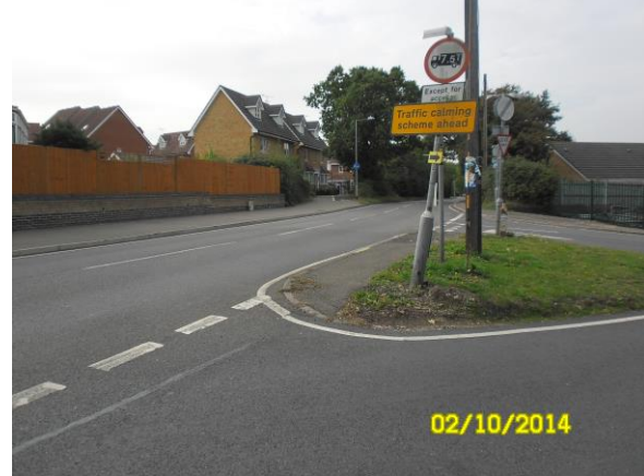
Dunton Road looking South Westbound