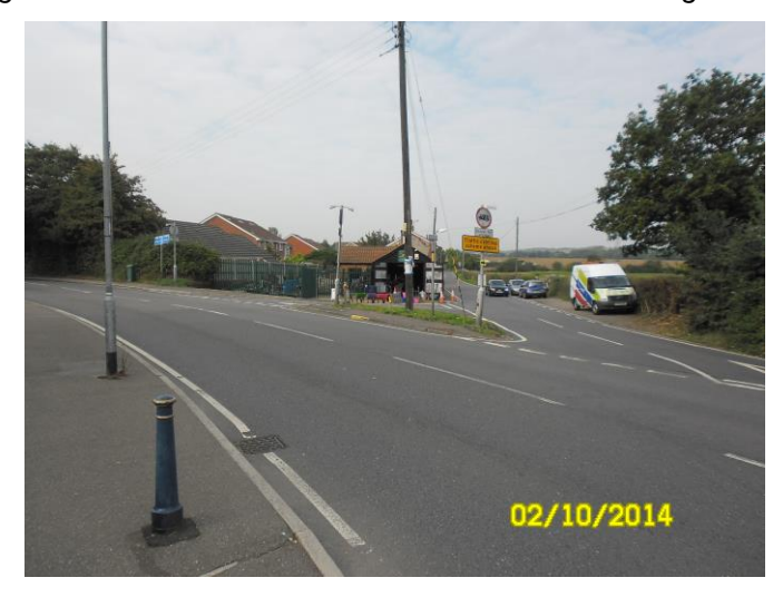
Wash Road West looking towards Dunton Road